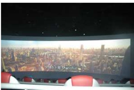
Watching a 3D movie in GM-SAIC Pavilion

After visiting most of the case pavilions in Urban Best Practices Area, I began to visit corporate pavilions in the afternoon. When I passed the Pavilion of Future, there was not a long queue so I luckily got in line with few people ahead of me, but immediately a crowd came in line behind me. The Pavilion of Future displays the current problems of cities and tries to find possible solutions.