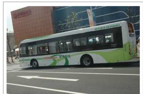
Taking an Expo bus in front of the Railway Pavilion

Shipping Pavilion was my next stop. A series of ship models are on exhibit there, and you are able to experience the life of sailing through pictures and videos. The Creative Corridor in Shipping Pavilion enables visitors to operate a virtual ship on the wall themselves.